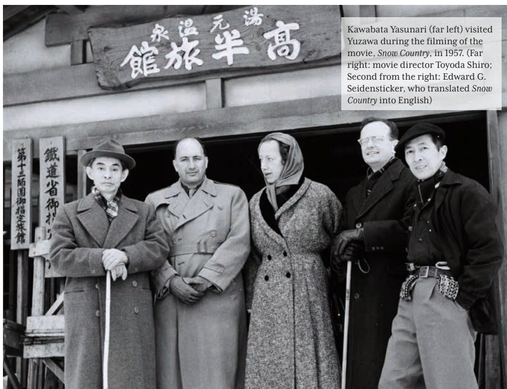
Kawabata Yasunari (far left) visited Yuzawa during the filming of the movie, Snow Country , in 1957. (Far right: movie director Toyoda Shiro; Second from the right: Edward G. Seidensticker, who translated Snow Country into English)