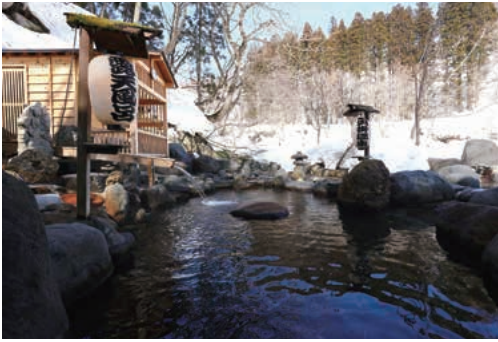
Above: Kawabata, known for his love of hot springs, made frequent visits to Yuzawa.