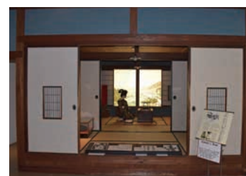
Below: An exhibition corner featuring the relocated room where Matsue, believed to be the model for the heroine Komako in the novel Snow Country , lived, allowing visitors to immerse themselves in the narrative's world at the Yuzawa Museum of History and Folklore (Yukiguni-kan)